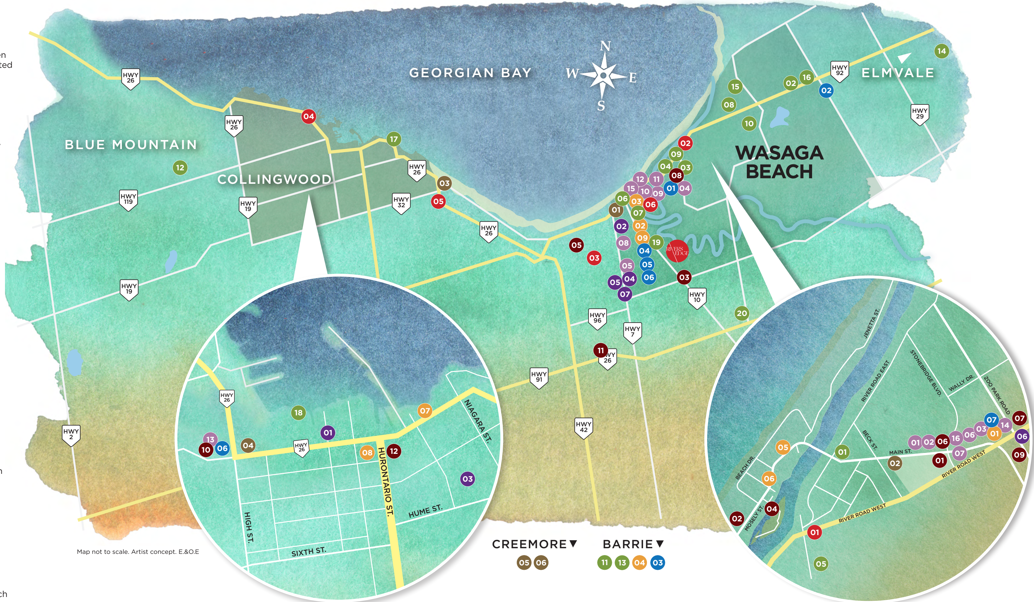
Map not to scale. Artist concept. E.&O.E