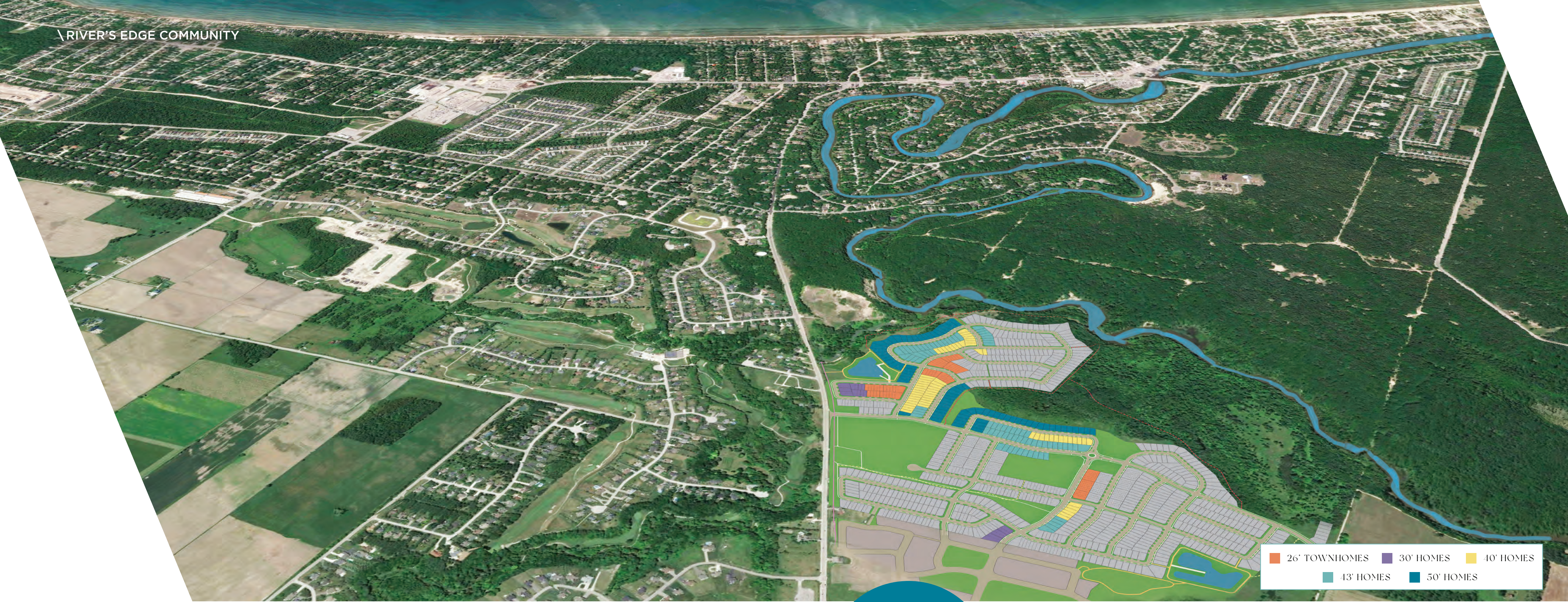
Map not to scale. Artist concept. E.&O.E

26' TOWNHOMES 30' HOMES 40' HOMES 43' HOMES 50' HOMES