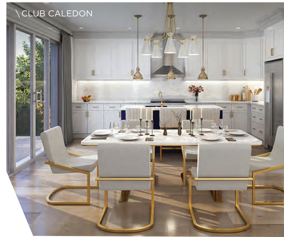
\ CLUB CALEDON