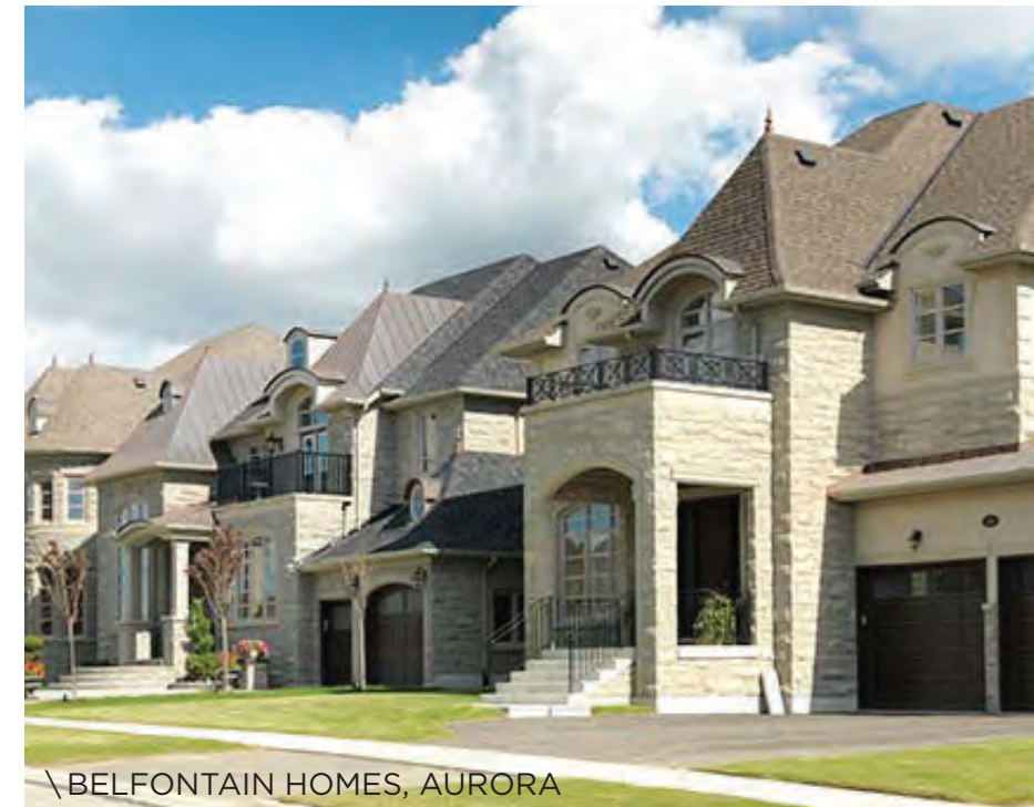
\ BELFONTAIN HOMES, AURORA