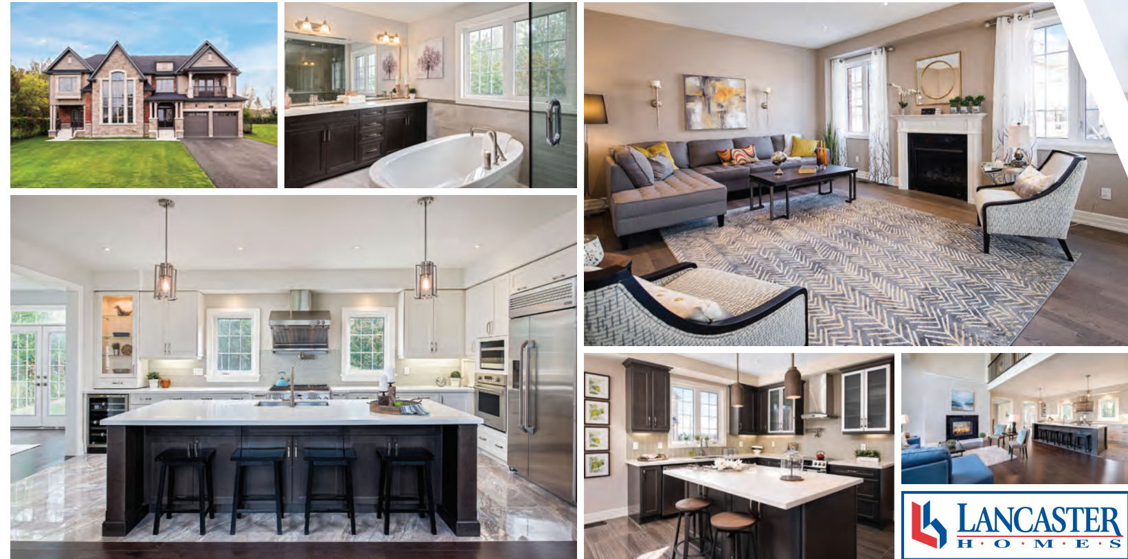
Renderings are artist concept and not to scale. E.&O.E

From affordable starter homes to beautiful brick and stone estate designs, with communities surrounding lower Lake Simcoe, Niagara Region and North Oshawa, Lancaster Homes views homebuilding as an opportunity to create something of timeless beauty and lasting value. In a Lancaster Homes community, you'll experience the warm and friendly lifestyle of a well-planned neighbourhood centered upon distinctive homes built to exacting standards of excellence.